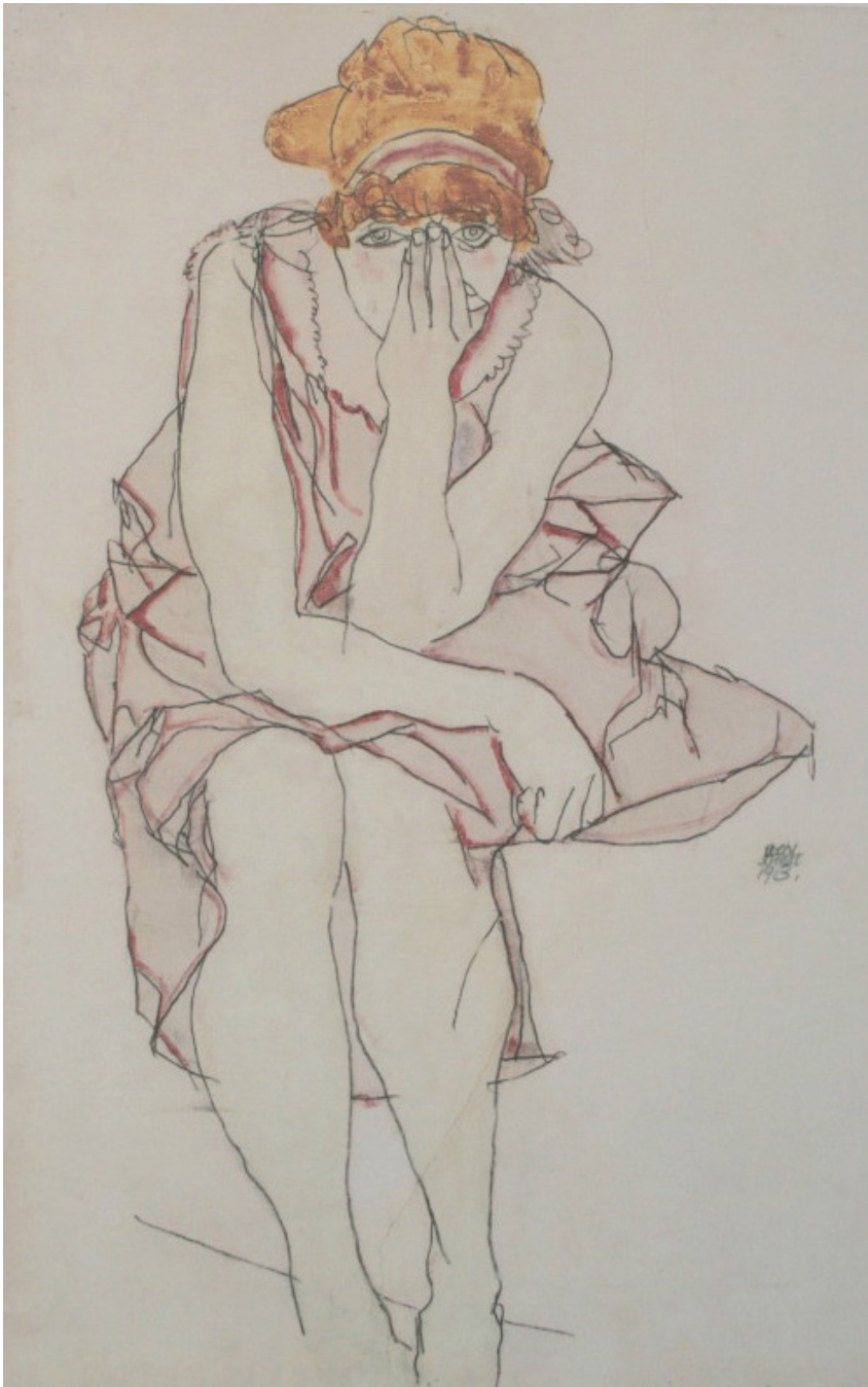
Seated Young Lady, Egon Schiele, 1917